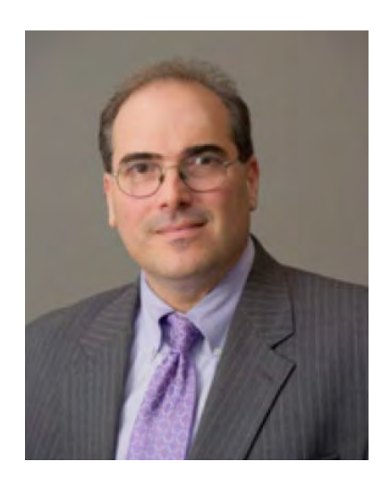
Sam Eisen Director of The Language Flagship Defense Language and National Security Education Office at the United States Department of Defense